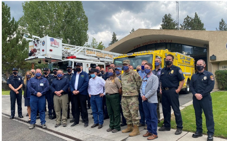
Clark County Fire Department staff and apparatus at Tahoe Douglas Fire District during the Caldor response with dignities.

The Caldor Wildland Fire Incident started outside of the Lake Tahoe Basin, but quickly grew in size to impact the Lake Tahoe Basin. While it never entered Nevada, California residents were evacuated into Nevada, supply chain impacts were felt, and resources were drained in Northern Nevada to assist our California partners. Previous efforts of the Committee led to an effective Nevada response: resources were brought up from Southern and Rural Nevada using Intra-State Mutual Aid provided for under NRS 414A. Personnel were exchanged between California and Nevada to ensure coordination occurred. The Committee was briefed and discussed the efforts as this was a first for Nevada.